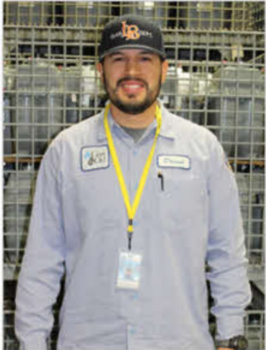
Energy Resources Department's Uniformed Installer

All installers are required to have a valid identification badge, company logo on the vehicle and to be in uniform. Please view the images below to see what CLB's and UPA's vehicles, uniforms and identification badges will look like. Customers are encouraged to ask for identification and to call the City directly at 562-570-5700 to verify the installer's identity.