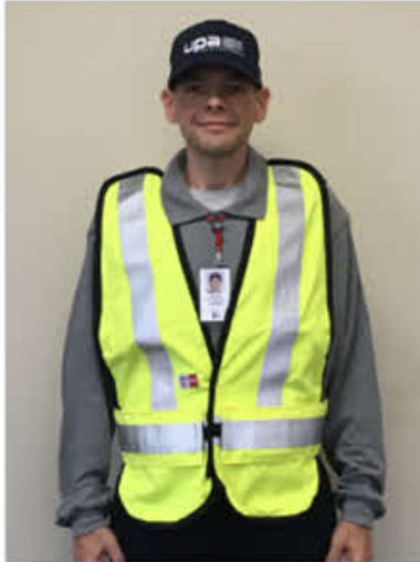
UPA Uniformed Installer