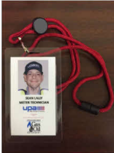
UPA ID Badge