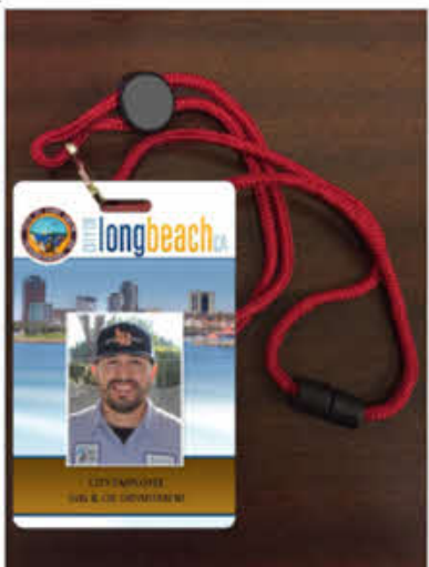
Energy Resources Department's ID Badge