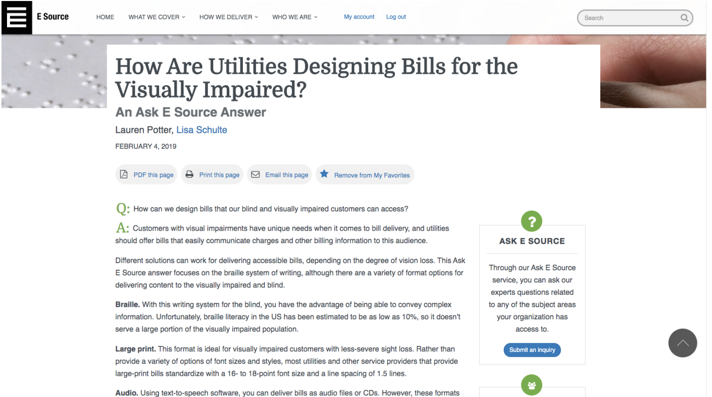
Figure 2: New link and button color

Our design team solved this issue by using our other favorite E Source color, blue, which gives a healthy ratio of 4.5:1.0 (figure 2).